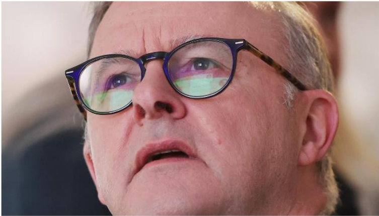
Anthony Albanese says he believes the Voice can still be successful.

Australians will head to the polls on October 14 to have their say on whether to enshrine an Indigenous advisory body, the Voice, in the Constitution.